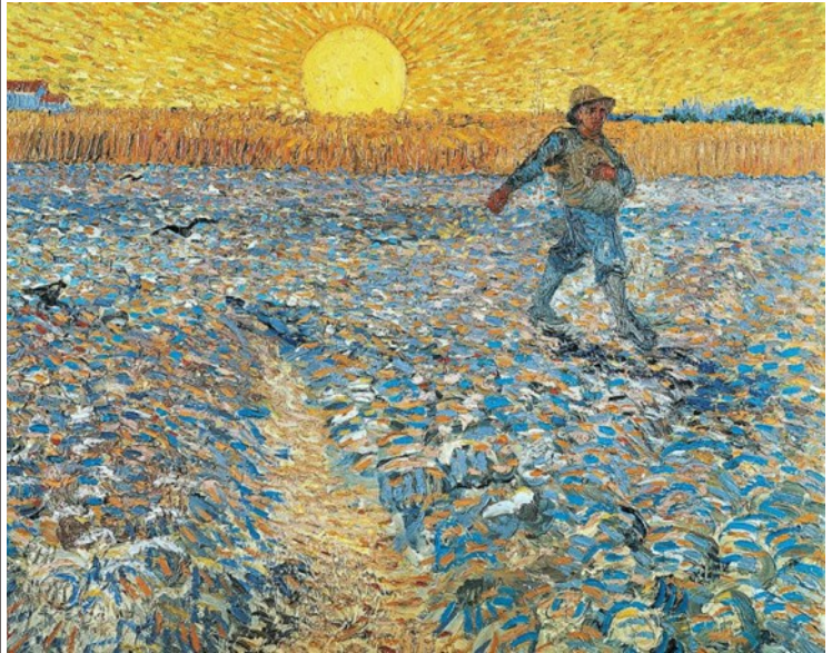
van Gogh, The Parable of the Sower

Pastoral Associate: St Joseph's Q/H, St Monica's K/F