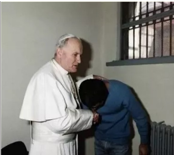
POPE JOHN PAUL II FORGIVES HIS ASSAILANT, 1981